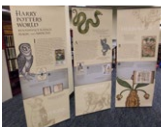
Promotional Standaees & Dispensers