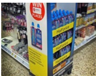
Point of Purchase, Point of Display & Point of Sale Stands