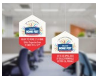
Danglers & Signage