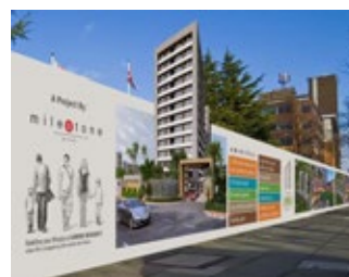
Advertising Boards & Hoardings